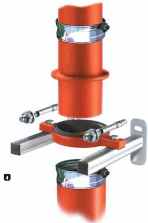
(Zinc plated cantilever brackets supplied separately)