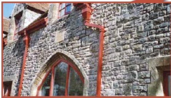
Hunsham Stables, Tiverton

Premier Extra Coloured products are painted to order and priced on application. Quotes will be provided using Premier Extra Black Gloss codes and prices with a separate surcharge to account for the specified paint required and the special use of painting facilities.